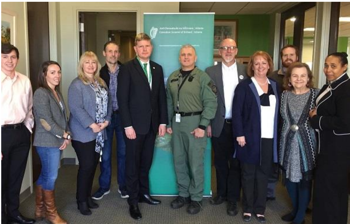
We also hosted our annual lunch and coordination meeting with representatives of Atlanta's Irish business and cultural organizations.