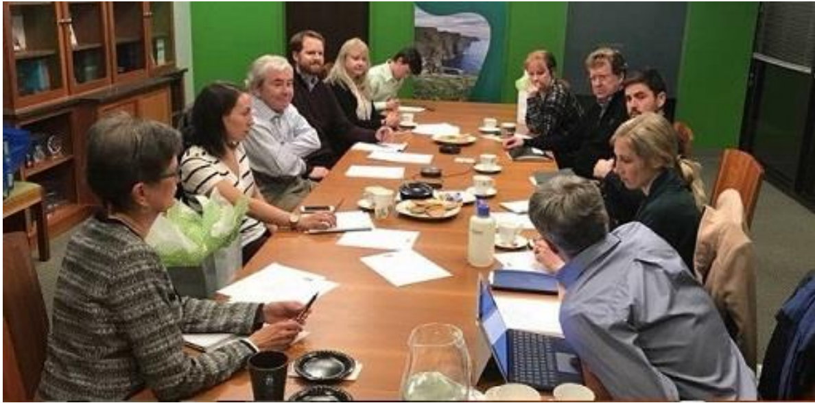
Back in Atlanta, Consulate staff welcomed Irish Network Atlanta's board for their quarterly meeting.