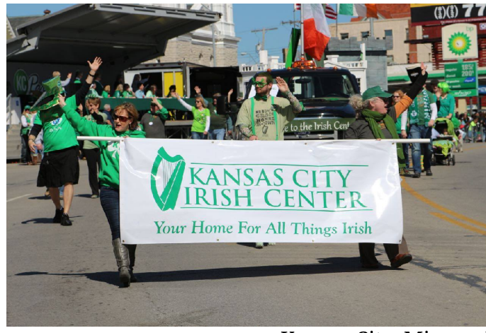
Kansas City, Missouri