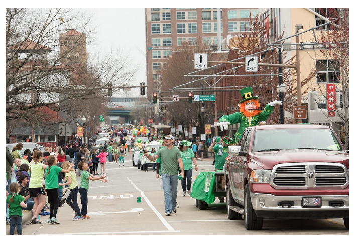
Little Rock, Arkansas