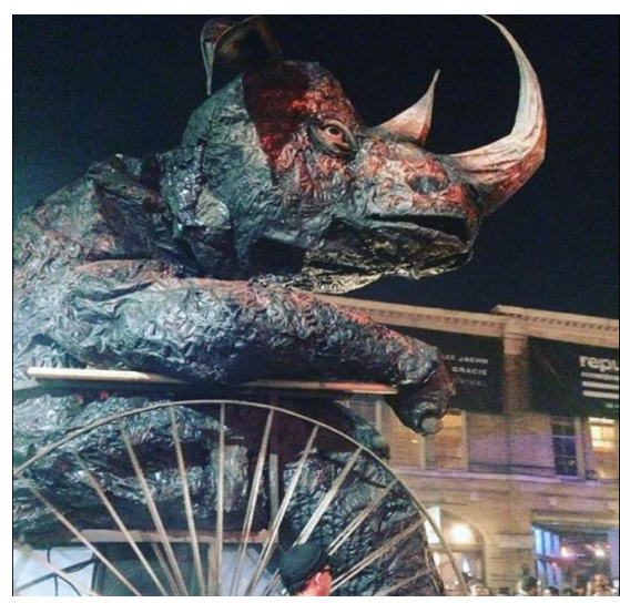
Macnas performs in downtown Austin

On March 12, Macnas, supported by IDA Ireland and Culture Ireland, presented "The Boy Explorer" parade along 6th Street as part of the South by Southwest festival in Austin celebrating Irish culture and creativity. The parade in downtown Austin was a massive hit and later that same week great new Irish artists performed across Austin at SXSW Music. The Irish Film Board also screened several new Irish features during SXSW Film.