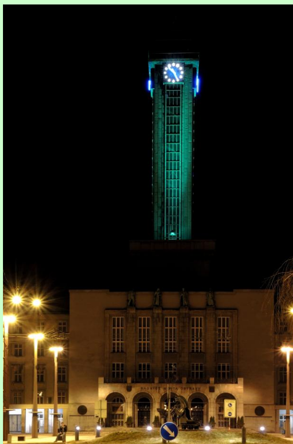
Ostrava City Hall

There are many famous attractions and sites around the world which go green to mark St Patrick's Day every year, including the Pyramids in Egypt, the 'Welcome' sign in Las Vegas, the Sydney Opera House, the Leaning Tower of Pisa, the London Eye, Table Mountain in South Africa, Niagara Falls, the Empire State Building in New York, the Prince's Palace in Monaco, the Allianz Arena and Odeonsplatz in Munich, the Sky Tower in New Zealand and the Cibeles Palace and fountain in Madrid. Last year the Sleeping Beauty's Castle at Disneyland® Paris, the Holmenkollen ski jump in Oslo or the UNESCO World Heritage Site of Petra in Jordan joined the Greening. Among this year's new additions will be the Colosseum in Rome, the Sacré-Cœur Basilica in the fabled district of Montmartre overlooking Paris and the Grand Ole Opry (the show that made country music famous!) in Nashville.