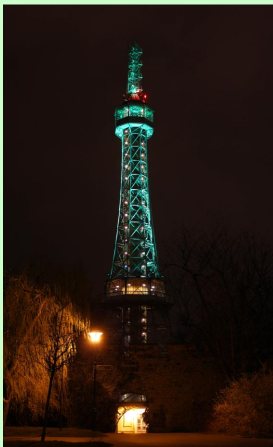
Petřín Tower