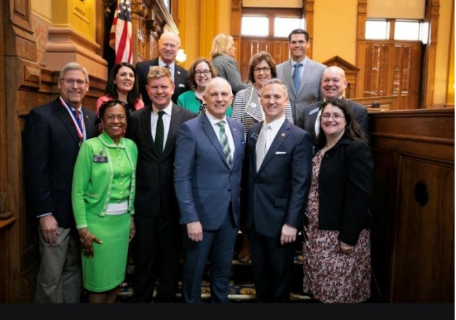
Minister Stanton brought greetings from Ireland to Georgia's House and Senate and outlined our Global Ireland Strategy for doubling our impact in this region by 2025.

Top: Minister Stanton met with the City of Atlanta