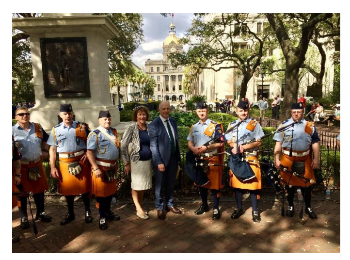
Right: Omagh Protestant Boys Melody Flute Band travelled from Northern Ireland with the support of the Consulate, Ulster Scots Agency and Northern Ireland Bureau in order to participate in this year's Savannah parade