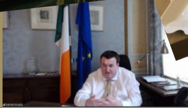
Minister for Overseas Development and Diaspora, Colm Brophy, met with some of the Irish organisations in our region.