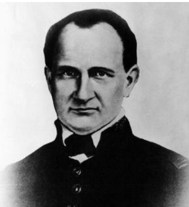
James S. Calhoun

Some years later, in 1851, James S. Calhoun, also of Irish ancestry, became the first Territorial Governor of New Mexico.