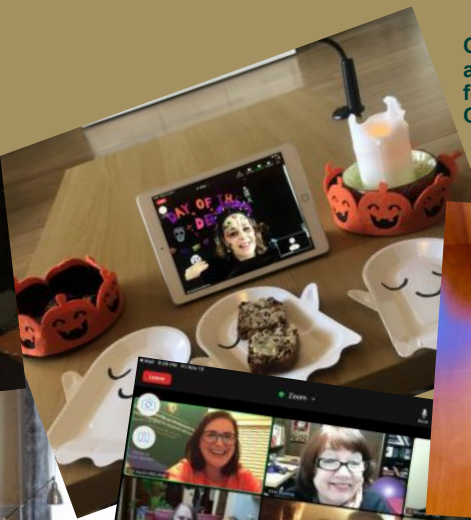
On 1 November, our Consulate hosted a Hallowe'en & Day of the Dead event for children together with the Mexican Consulate in Austin.