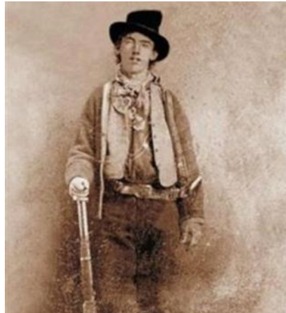
William Bonney, AKA Billy the Kid

Some years later, in 1851, James S. Calhoun, also of Irish ancestry, became the first Territorial Governor of New Mexico.