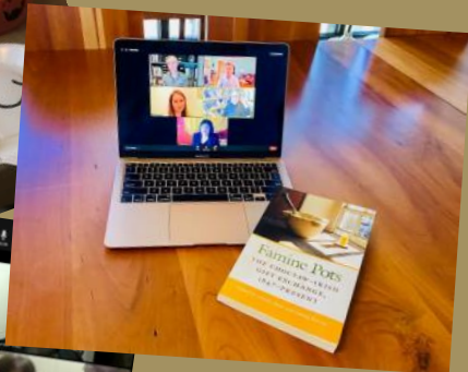
On 3 December, our Consulate co-hosted a book launch for 'Famine Pots: The Choctaw-Irish Gift Exchange' with the American Conference of Irish Studies.