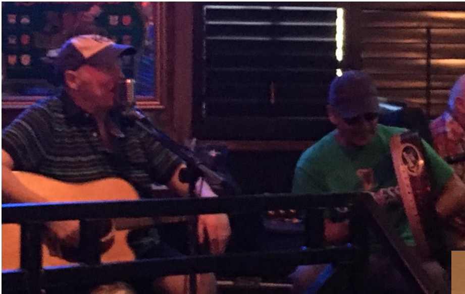
Top Left: Kansas City

Bloomsday celebrates the legacy of James Joyce and in particular his work Ulysses . The Consulate hosted its inaugural Bloomsday with readings and a reception assisted by our great partners including the Finnegans Wake Joyce reading group, the Harry Ransom Center at the University of Texas in Austin and Malvern Books. Bloomsday was also celebrated in Kansas City, Houston Tulsa and cities across the region.