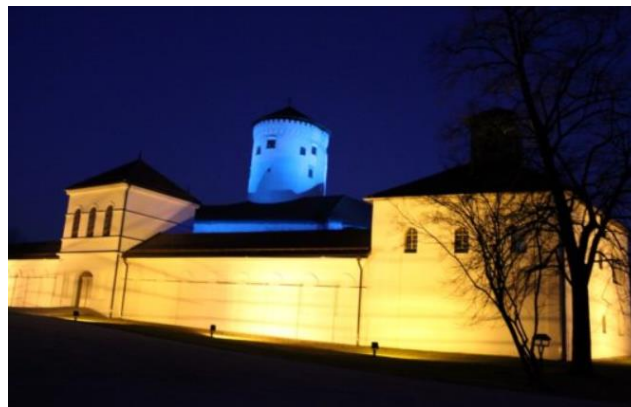
Budatín Castle in Žilina in colours of Ukraine on 17th March as a mark of solidarity