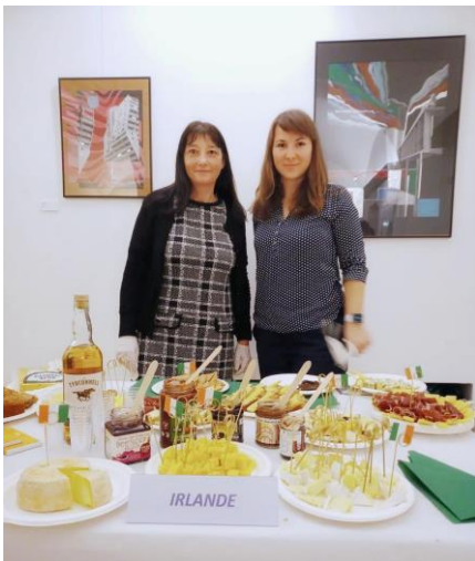
Embassy team at French Institute in Bratislava