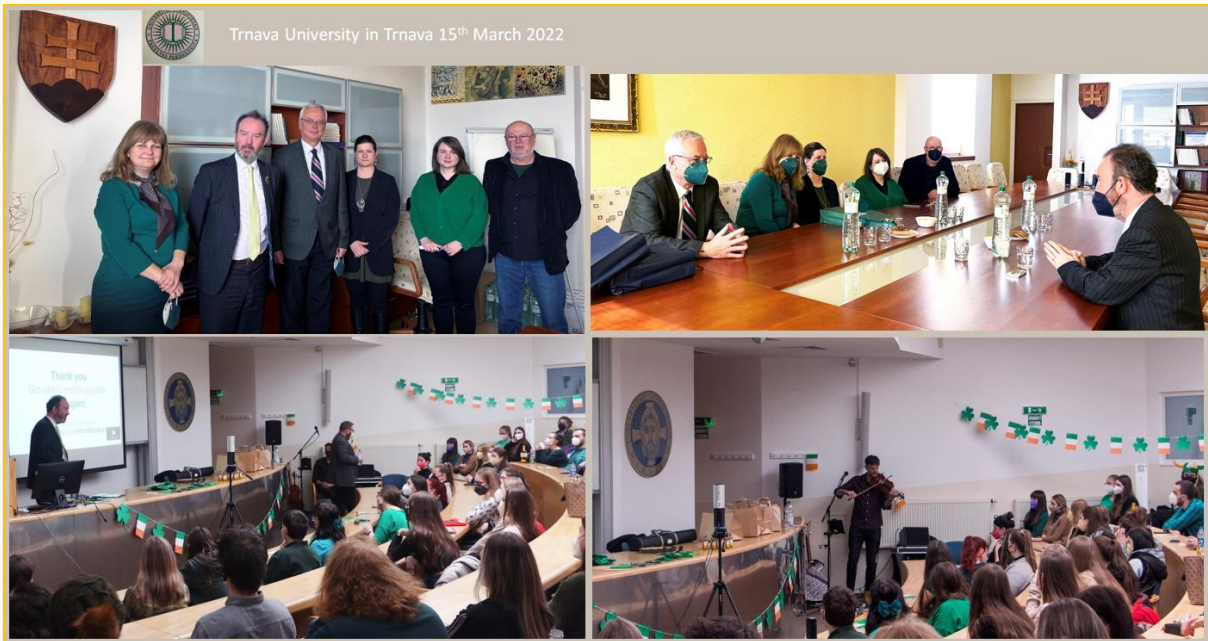
Ambassador at the Faculty of Education at the University of Trnava meeting with senior faculty staff and students during St. Patrick's Day celebrations.