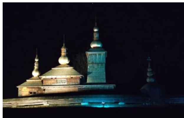
Slovak National Museum of Ukrainian culture lit in colours of Ukraine on 17th March as a mark of solidarity