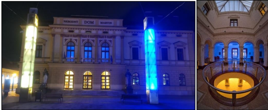
Slovak Chamber Theatre in Martin lit in the colours of Ukraine on 17th March as a mark of solidarity

Across the world, including here in Slovakia, it has become an annual tradition for buildings and public landmarks to light up in green on Saint Patrick's Day. This year, as Ireland stands with Ukraine, we asked our generous partners to consider lighting their buildings in gold and blue instead as a sign of solidarity with the people of Ukraine. We are deeply grateful to all our Slovak partners for their ongoing friendship and cooperation on Saint Patrick's Day.