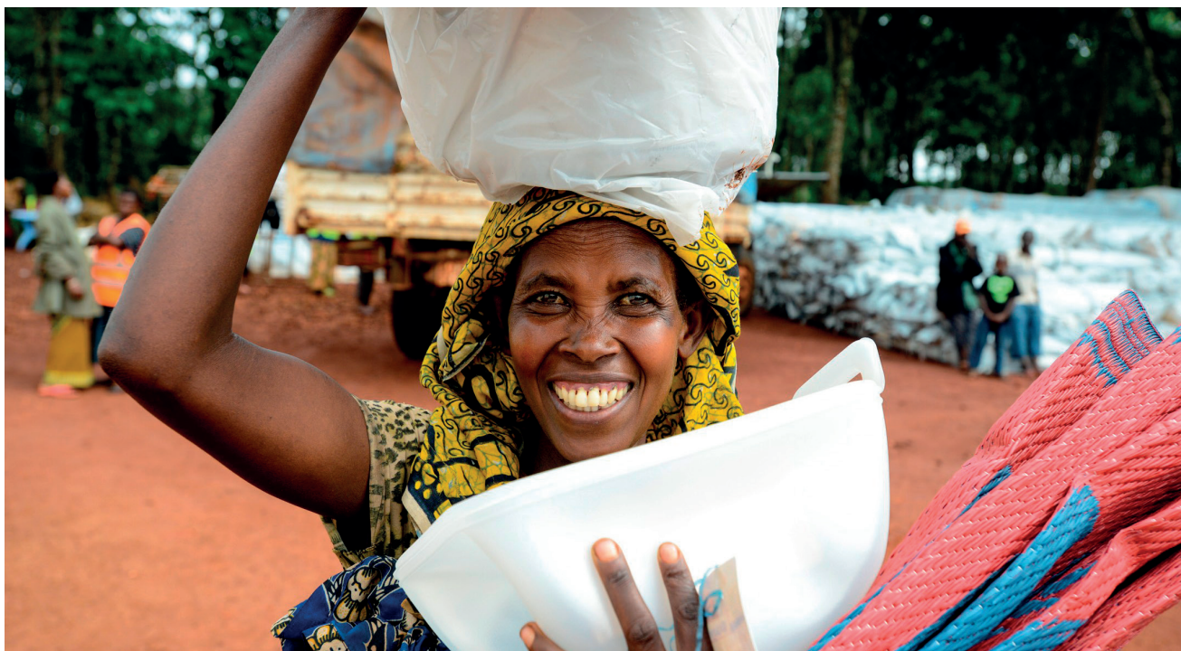
A woman receives Non Food Items (NFIs) in Nduta refugee camp.