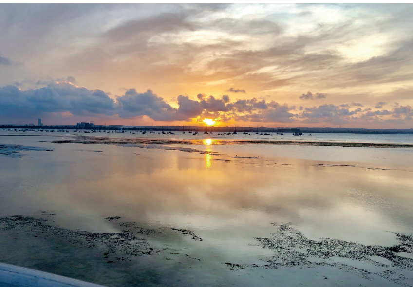
Sunset Dar es Salaam.

Enhanced people-to-people, business, and institutional links between Ireland, Tanzania, and the sub-region