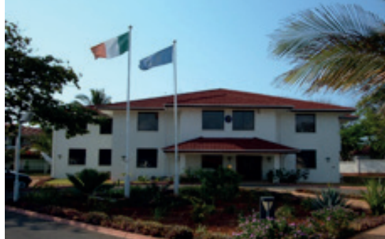
Embassy of Ireland, Dar es Salaam

This Mission Strategy sets out Ireland's engagement in Tanzania and the Great Lakes sub-region (Burundi, Democratic Republic of Congo, Seychelles, and Comoros) for the period 2017–2021 and beyond.