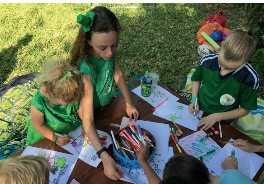
St Patrick's Day Children's Party.