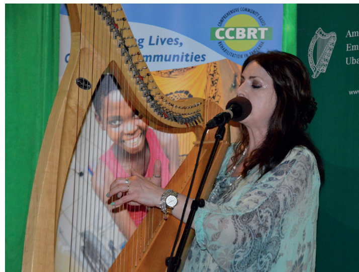
Moya Brennan performing at the Ambassador's Residence, March 2017.