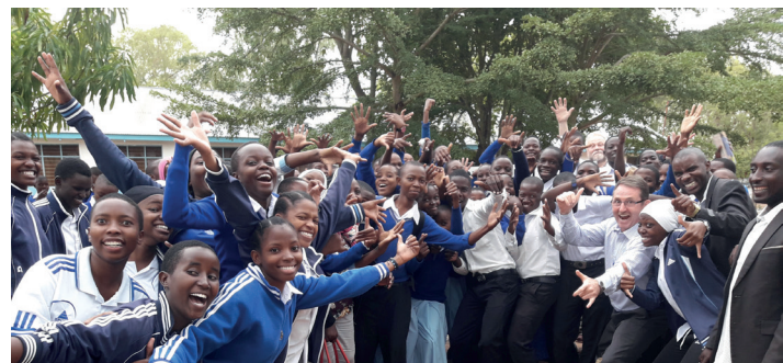
Fema Club

In the absence of real progress on job creation, the large, connected and increasingly well-educated youth in East Africa may join the irregular migration routes to Europe. Radicalisation of youth is also a risk in the medium term, with both the EU and UN planning to support Tanzania in countering violent extremism.