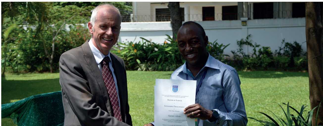
Fellowship alumni student award in Ireland 2017.